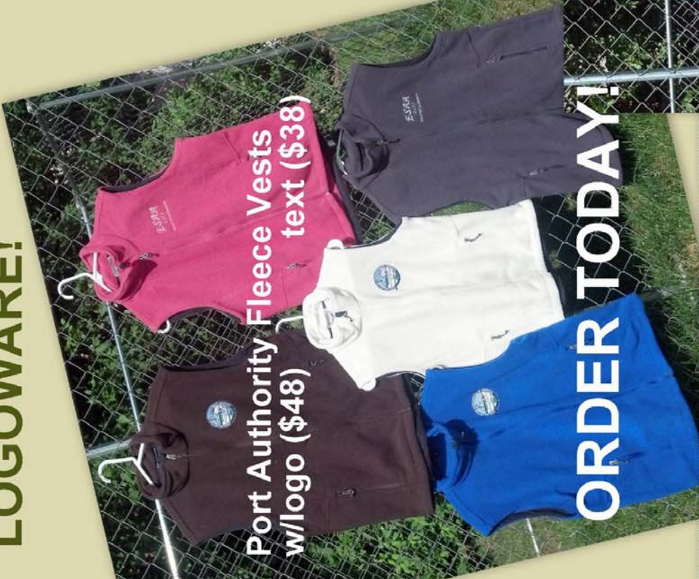
Port Authority Fleece Vests w/logo ($48) text ($38)