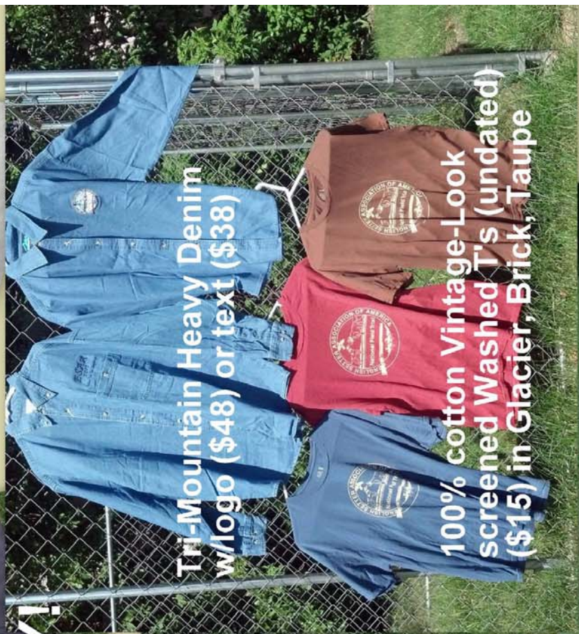
Tri-Mountain Heavy Denim w/logo ($48) or text ($38)