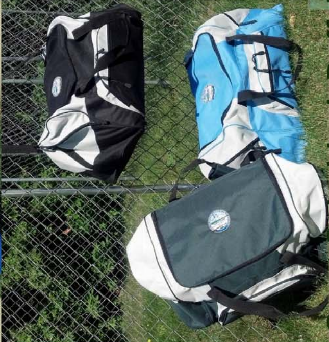
Great Colorblock Duffels w/logo only ($45) in blue, green, black

To place order, use form or visit our Blog!