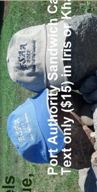
Port Authority Sandwich Cap Text only ($15) in Iris or Khaki