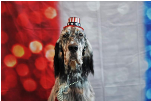
2019 National Fever