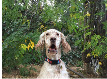
2019 National Takes Shape

Check out the National web site: www.national.esaa.com for the latest information about this year's ESAA National, including the premium list. Most everything you need to know is right there.